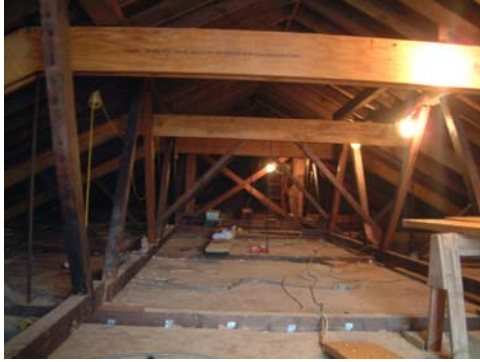
Mystic Congregational Church, Mystic, CT