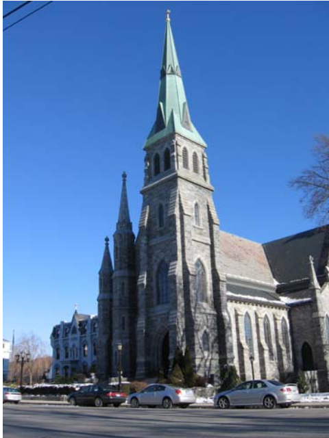
St. Patrick's Cathedral, Norwich, CT